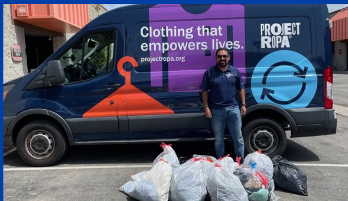
The Ross team held a clothing drive and collected 12 (20 gallon) bags to donate to local non-profit organization Project Ropa