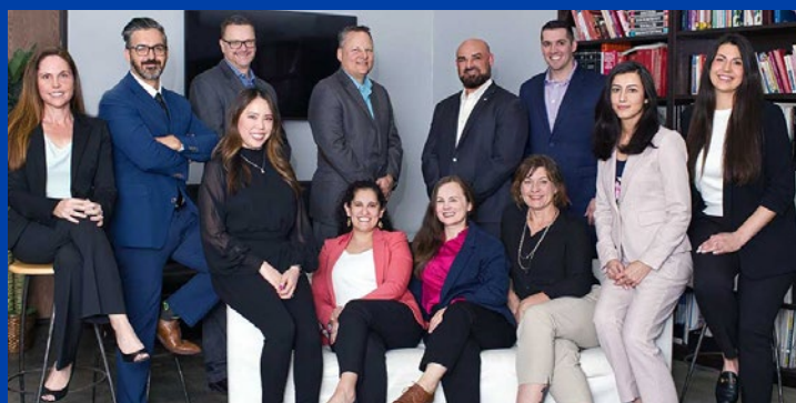
Our "Meet the Sales" team page has been updated on the website. Take a visit to learn more about our newest Technical Sales team members.