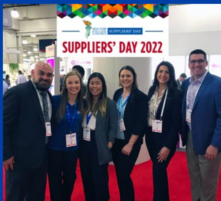
The Ross Organic team last month at NYSCC Suppliers' Day in New York